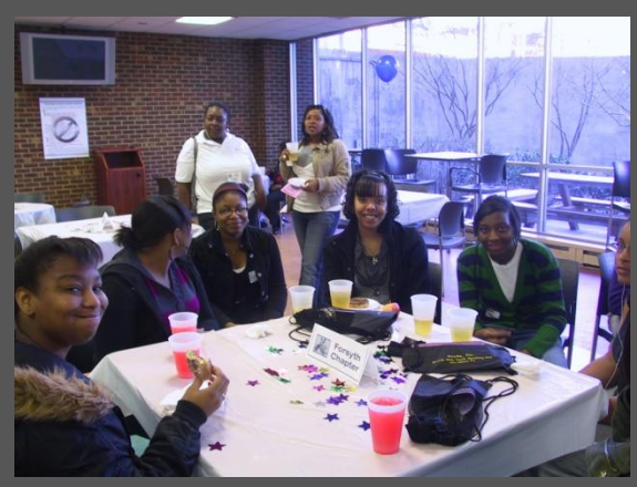
Guilford Technical Community College Jamestown