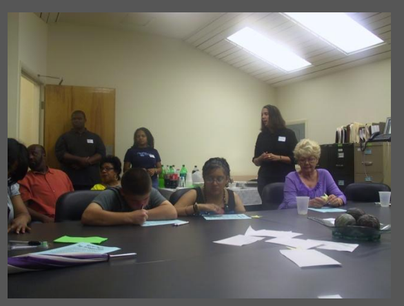
Raleigh: NC General Assembly